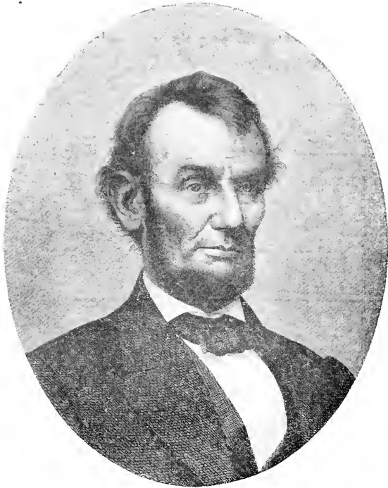
ABRAHAM LINCOLN, Fourteenth President of the United States.

Its gold, the reflection of Paradise street: Its white, the effulgence of Christ's mercy seat— An angel, calm, radiant, of presence august, The great golden balance of mercy adjust, And millions of martyrs on battlefield slain, Like the voice of the ocean, repeated the strain: "O, States of the Union, all warfare shall cease: Christ lifts o'er the nations the banner of Peace, As the prism-banded Bow of the sky stanch'd the Flood, Its earth-child, the Flag, ends the deluge of blood, War's death-dealing cloud has rolled harmlessly by.